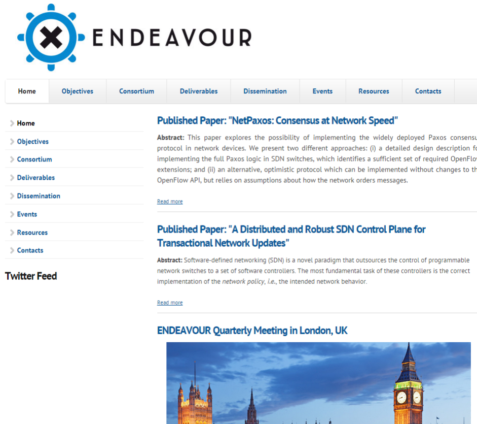
Figure 2: Main menu of ENDEAVOUR website

When the portal is accessed, users will first find a homepage with recent news/events and the Main Menu. This menu is structured in basic sections